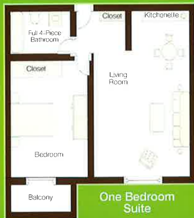
One Bedroom Suite